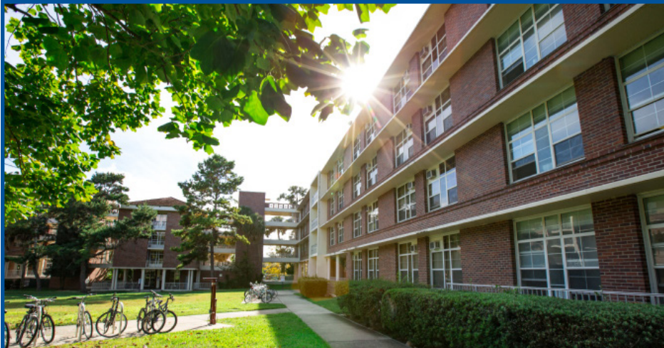
From top left, clockwise: Broward Hall, Thomas Hall, Yulee Hall, Mallory Hall, and UF Whitney Laboratory for Marine Bioscience